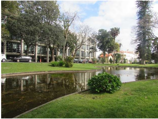
Campus at the University of the Azores