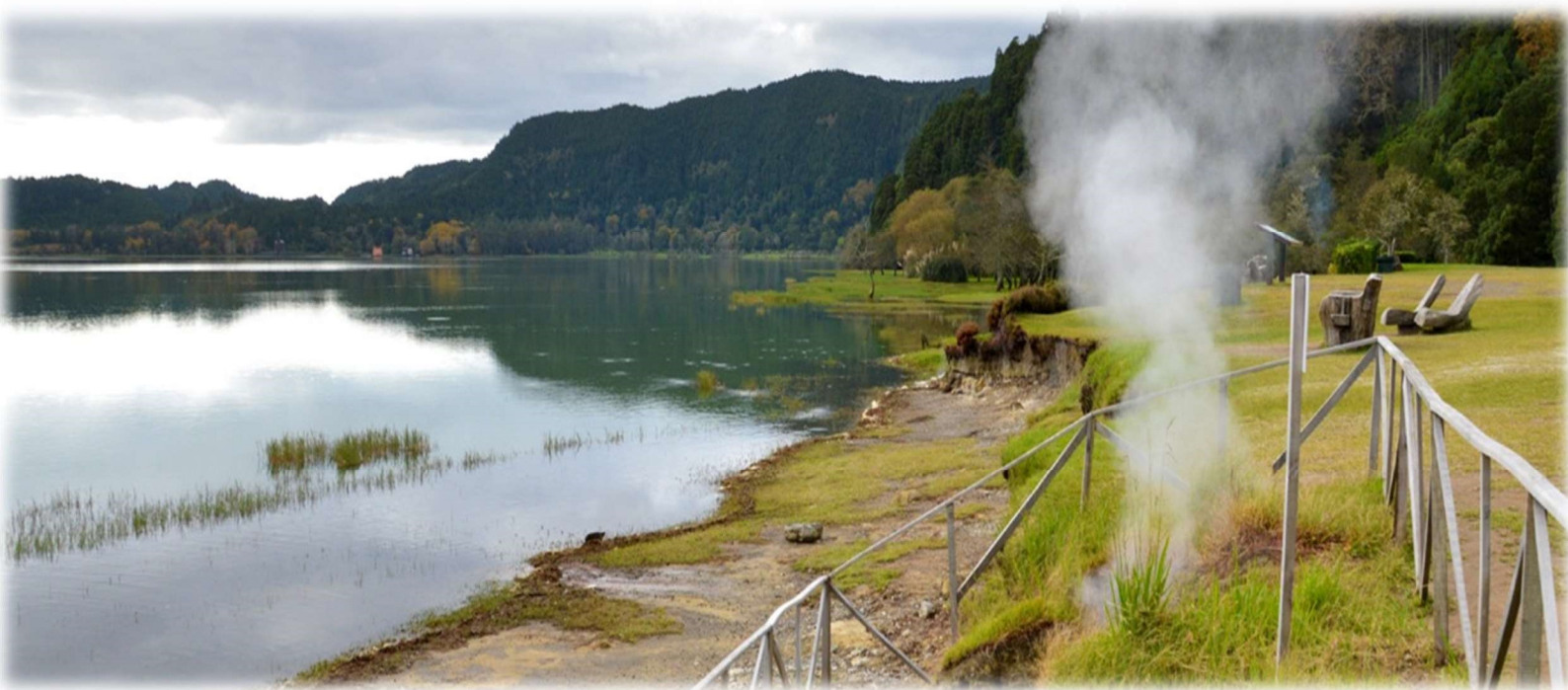
Furnas Lake surrounded by a fumarolic field.

CVL 11 will offer formal scientific sessions and field visits to volcanic areas where intracaldera lakes exist. Visits are planned to the lakes of the quiescent Fogo, Furnas and Sete Cidades volcanoes at São Miguel Island. These lakes offer ample field sampling and measurement opportunities, including water column sampling and lake-surface degassing measurements. Additional geochemical and geophysical measurements on the fumarolic field around Furnas Lake are also an option.