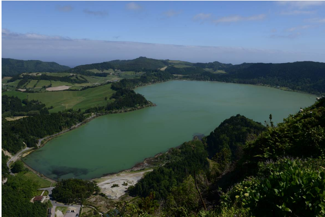
Furnas Lake and one of the hydrothermal fumarolic fields located inside the caldera of the Furnas Volcano.

Fogo Volcano (also known as Água de Pau), is a depressed area of about 4.8 km 2 , with a maximum diameter of 3.2 km and walls as high as 370 m, inside which a pumice cone and several domes can be observed (Wallenstein et al. , 2015). Fogo Volcano dominates the central portion of the island, with an area of 132 km 2 and a subaerial volume of about 44 km 3 and corresponds to a complex volcanic system dated from > 200 ka (Muecke et al. , 1974). The last magmatic events occurred already after the settlement of the island on 1563 and corresponded to a subplinian intracaldera eruption followed by a basaltic flank episode. A phreatic intracaldera episode was recorded in 1564 (Wallenstein et al. 2015).