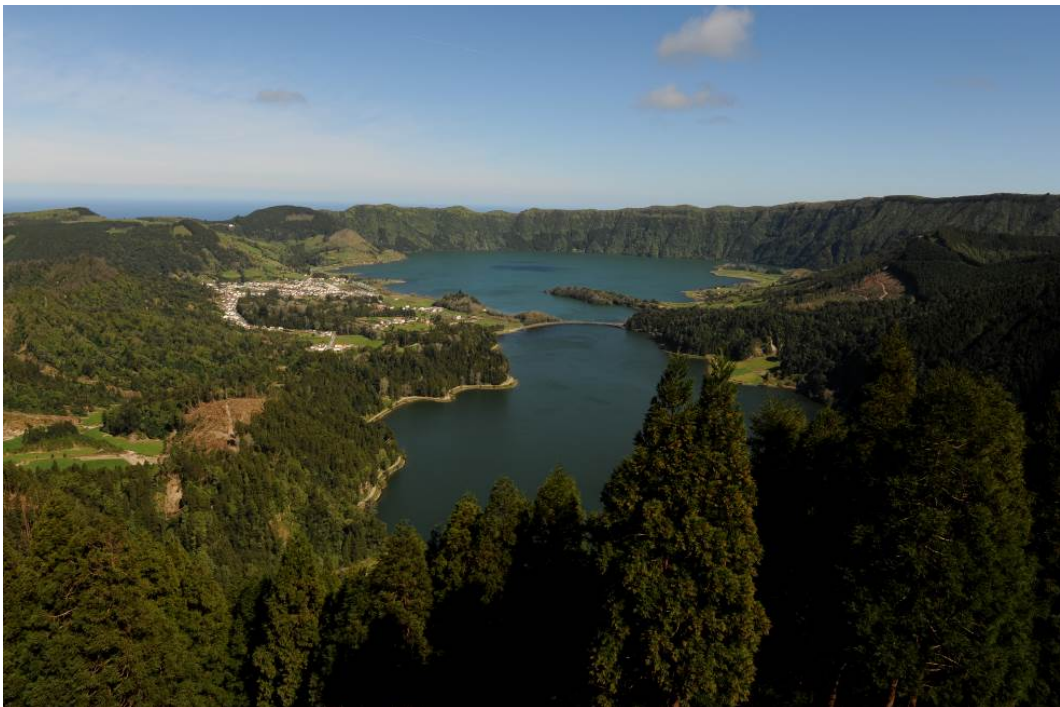
Sete Cidades Lake inside the caldera of the Sete Cidades Volcano.

\text{CO}_2 flux values measured in the lake surface range between 0 and 34.8 \text{ g m}^{-2} \text{ d}^{-1} , presenting a mean value of 8.3 \text{ g m}^{-2} \text{ d}^{-1} . The higher \text{CO}_2 fluxes were measured during the winter surveys ( 5.6 \text{ t d}^{-1} ), while the lowest values ( 0.2 \text{ t d}^{-1} ) were recorded in the summer. These seasonal differences observed are associated with the monomictic character of the lake, as the \text{CO}_2 is not able to ascend to the surface when the water column is stratified during the warmer period (Andrade et al. , 2019).