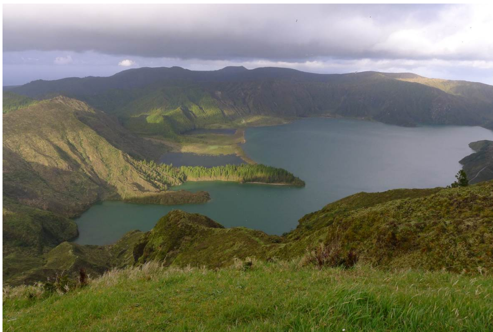
Fogo Lake inside the caldera of Fogo Volcano.

Measured CO 2 flux values are relatively low, ranging from 0 to 28.4 g m -2 d -1 (mean = 2.6 g m -2 d -1 ). The very low values measured in the central area of Fogo Lake are associated with the monomictic character of the lake. Statistical analyses suggest that the CO 2 emission is associated with a single source of CO 2 , probably biogenic; in agreement with the water δ 13 C isotopic content. The estimated total CO 2 emissions from the Fogo Lake was approximately 4.2 t d -1 .