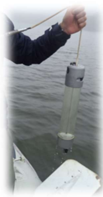
Vertical profiles carried out along the water column.

Gas sampling and potential geophysical measurements in the fumarolic areas on the shore of Furnas Lake will also be possible.