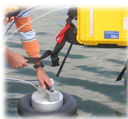
The CO 2 flux measurements using the modified accumulation chamber method.